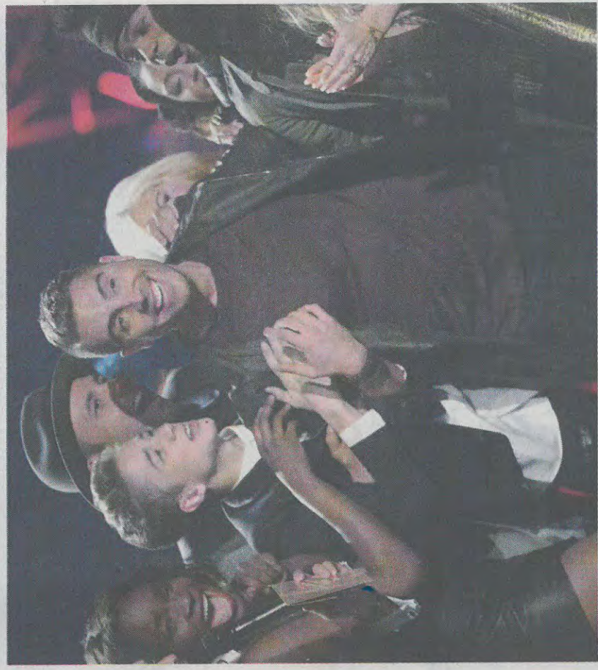
Participantes de la competencia felicitan al joven Nick Fradiani (centro), después de ser anunciado como el ganador de la versión número 14 de "American Idol", en el Dolby Theatre de Los Angeles, California el 13 de mayo de 2015.